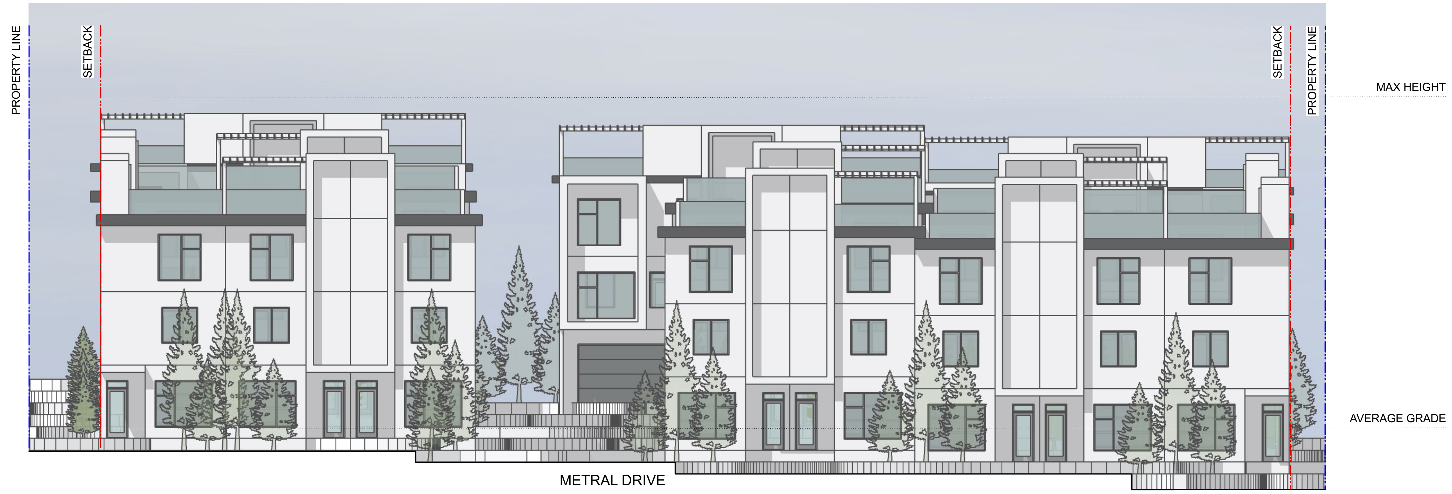
1 Metral Drive Section A2 Scale: 1/8" = 1'-0"